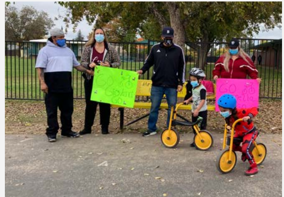
KidZCommunity, of Placer Community Action Council, Inc., 2022 Dollar per Child Trike-A-Thon fundraiser