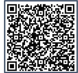
Annual Planning Calendar