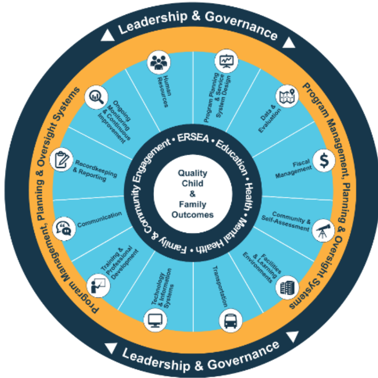
Head Start Manager System Wheel