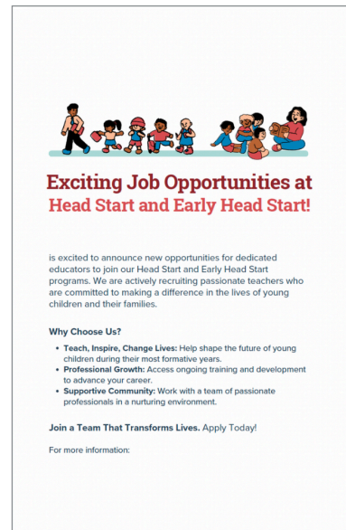
8.5 x 5.5" Half Letter Vertical